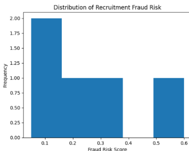
Fig. 4 Recruitment Fraud Detection Dashboard

The audit dashboard presents flagged cases with clear statistical justification, enabling verification through task logs and historical comparisons.