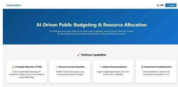
Fig. 1. AI-Driven Public Budgeting and Resource Allocation Dashboard

Overall, the workflow assessment ensures that the knowledge uncovered in individual modules is consistent when conveyed through the interfaces of the solution. For this reason, the findings confirm that the proposed solution validates the integrated governance decision-making process through predictive analytics, anomaly detection, and recommendation systems.